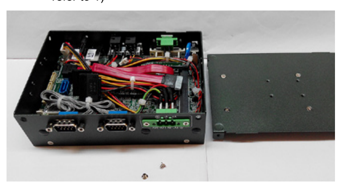
Step 1 Open SPC-3000 and take off the lower cover. (Please refer to 1)