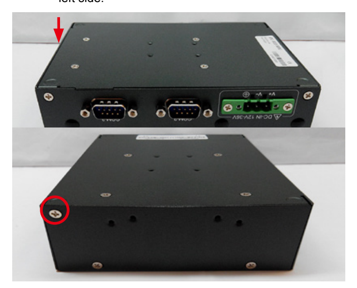
Step 3 Remove one FHS-M3x4 screw (circled in red) on the left side.